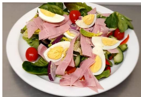
Salad from the church café

Donations to provide hot meals for Food Bank customers: Our Church Coffee Bar provides a warm welcome and good value meals to the Cotteridge Community throughout the week. But for sometimes even our prices are unaffordable. So throughout February, we are seeking £5 donations, each of which will provide a token for Food Bank users during Lent to be exchanged for a hot meal and a drink (or two children's meals). If you would like to donate, please do so by cash or card at the coffee bar till after the Sunday service or whenever the coffee bar is open. Thank you for your support