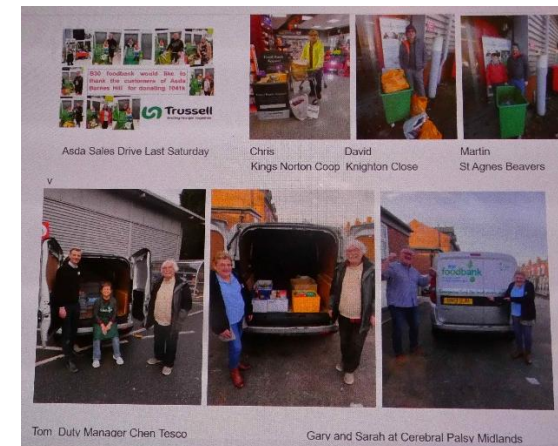
Aeda Sales Drive Last Saturday

urgent needs long life fruit juice and bars of soap