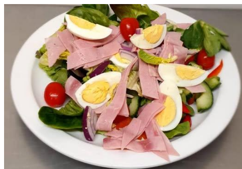
Salad from the church café

Donations to provide hot meals for Food Bank customers: Our Church Coffee Bar provides a warm welcome and good value meals to the Cotteridge Community throughout the week. But for some even our prices are unaffordable. So throughout February, we are seeking £5 donations, each of which will provide a token for Food Bank users during Lent to be exchanged for a hot meal and a drink (or two children's meals). If you would like to donate, please do so by cash or card at the coffee bar till after the Sunday service or whenever the coffee bar is open. Thank you for your support