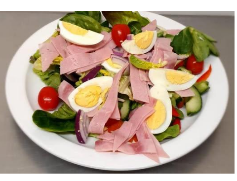
Salad from the church cafe

Sunday 9<sup>th</sup> March Church Action on Poverty Sunday Christian Aid Sunday 11th May