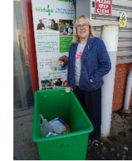
Helen Northfield Road