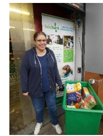
Jayne Oak Farm Road