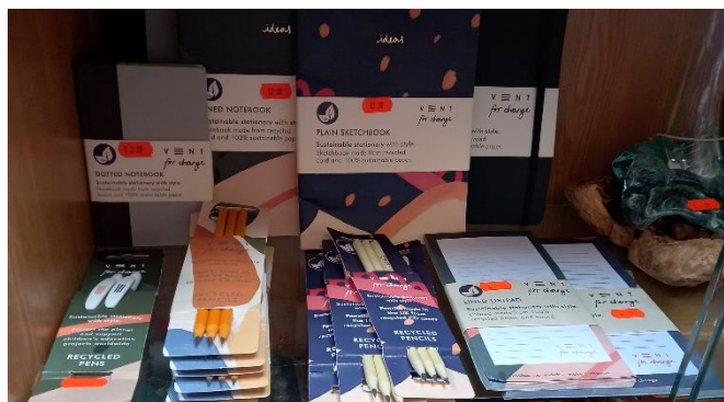
Focus on Vent Stationery