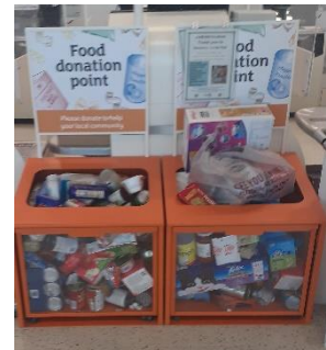
Sainsbury Longbridge donation point