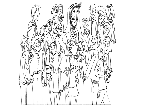
We welcome others even with just a cup of cold water.

Jesus tells us that when we welcome other people we are also welcoming him.